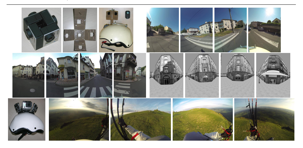
Figure 1: Two multi-cameras formed by four GoPro Hero3 cameras and images taken at a viewpoint for every dataset. Top and middle: the cameras are enclosed in a cardboard (for small baseline). Bottom: the housings provided with the cameras are used.