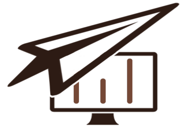
Figure 3: ExpLanes is an open source tool: http://mathieulagrange.github.io/explanes

Moreover, evaluation can be a tedious, time-consuming (“do we have time to run another series of tests on this?”) and error-prone (“were these the exact parameter values I used during the last run?”) task. It should therefore be as automated as possible. With those aims in mind, we built an open-source tool called explanes that greatly eases this process, by proposing a complete evaluation framework that strictly follows the scientific method, and automatically produces synthetic experiment reports.