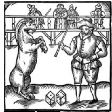
Figure 1: Hans is clever, but not quite: https://en.wikipedia.org/wiki/Clever_Hans

Less extreme, more common, and no less concerning, is the phenomenon of “Potemkin villages”, or systems that perform extremely well on a given dataset but fail to generalize. Leaving aside the “cherry picking” approach of specifically selecting data to show the system at its best, this can often happen due to a lack of care in ensuring the representativity of the evaluation dataset. This is for example the case in the field of environmental scenes modeling, where the Bag-Of-Frames (BOF) approach 2 was long