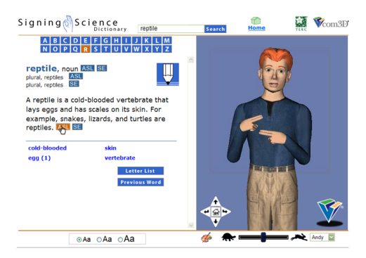
Figure 2: The Signing Science Dictionary.

- Generated animations are an alternative approach consisting in automatic and real-time generation of animations from description languages . For example, the SigML description language [2], based on the HamNoSys phonetic system dedicated to sign languages [3], is used as input in a given signing animation software. It allows the generation of animations that provide flexibility, but at the cost of realism. Java applets or VRML-based applications allow interaction within a web page, such as the Signing Science Dictionary [4] (see figure 2).