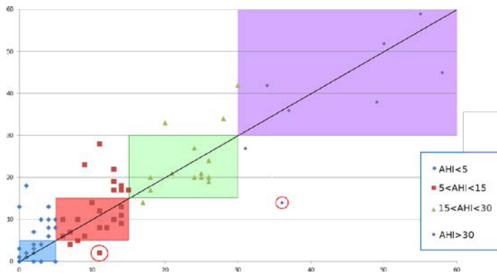
Figure 3. Comparison of results provided by the expert and the symbolic fusion process.

Results produced by symbolic fusion have been compared with those provided by an expert scorer. Figure 3 displays the results for the AHI with data given by the expert, resp. the symbolic fusion, presented on the x-axis, resp. the y-axis. The different ranges of disease severity are represented by colored rectangles. The result is “perfect” when the expert and the symbolic fusion agree, i.e. the point is located on the median axis. It is satisfying when it is located within the same rectangle. It is acceptable when the AHI is overvalued (located above the rectangle), but unsatisfactory when the point is located below the rectangle. Indeed, when the AHI is above a given threshold, a treatment is required. The adaptation of the treatment depends on other parameters and should be decided by a physician. The analysis of the data provided two cases in this later situation. The two points are surrounded by a red circle. The performance of the symbolic fusion was measured by an agreement ratio of 97.1% (68/70).