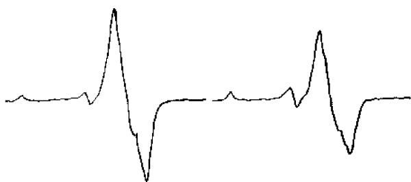
Fig. 2. ESR spectra of radicals induced in anhydrous ampicilline acid just after a 50 kGy irradiation (left) and six months later (right).

detection of radio-induced ions trapped in the solid matrix. Contrary to the protocol used for the detection of irradiated products where the TL signal is due to silicate impurities (CEN, 1996/97-a), there is no problem of extraction; the signal is easy to be recorded (Stocker et al, 1999).