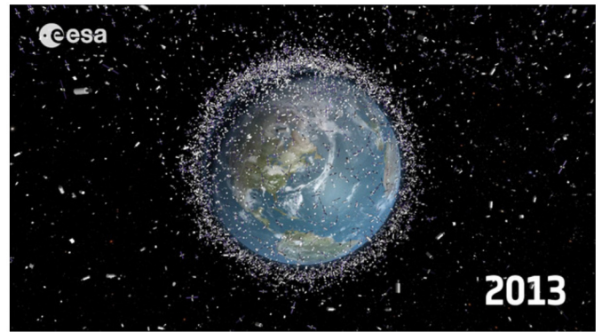
Fig. 4. Picture extracted from a video ( The story of space debris ) by ESA © ( http://www.esa.int ).

48 In this test-case, the failure scenario concerns a collision be- 49 tween a space debris and a satellite, both orbiting around an 50 Earth-centered inertial reference frame. The dynamical model used