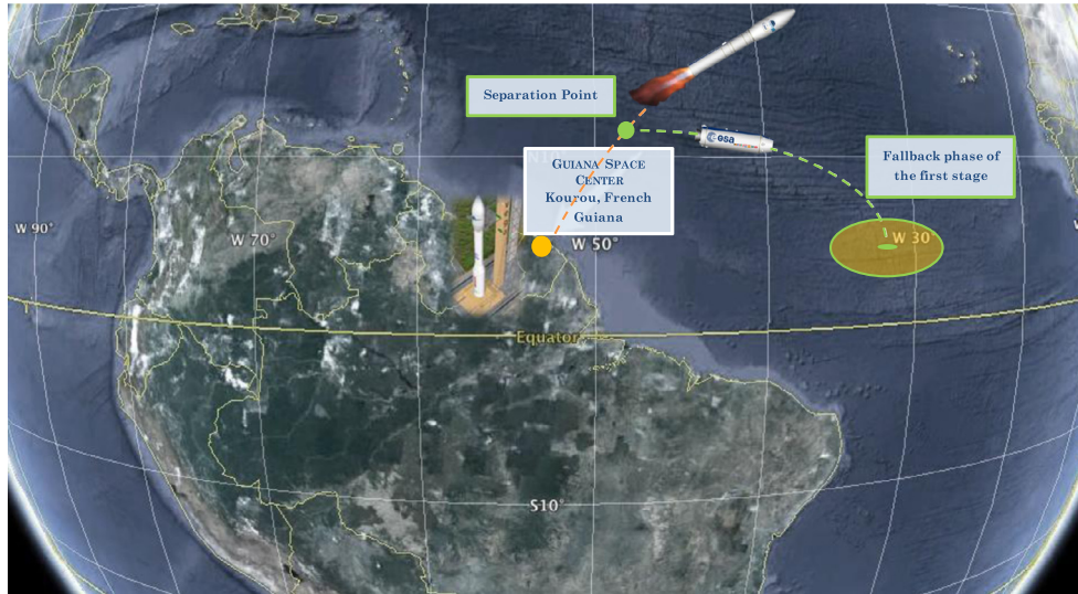
Fig. 3. Illustration scheme of the first stage fallback phase into the Atlantic Ocean.