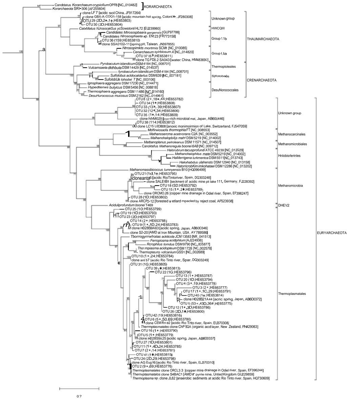
Fig. 3 Maximum likelihood tree of 16S rRNA gene homologs from the archaeal clones (in bold ) along with a selection of representatives of archaeal diversity. Numbers at nodes indicate a LTR (approximate likelihood ratio test) branch support as computed by PhyML. The

scale bar gives the average number of substitutions per site. The number in parenthesis indicates the number of clones for the sampling period which is represented by a symbol ( star April 2006, square October 2008, circle January 2009 and diamond November 2009)