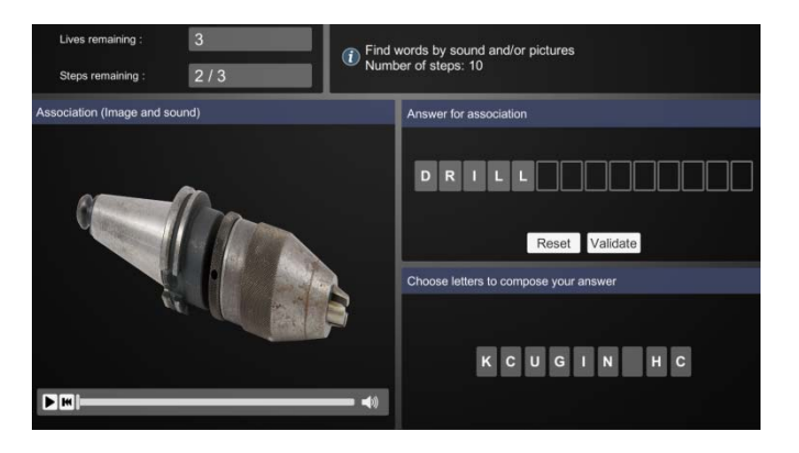
Fig. 2. "Machine tool accessory" mini-game.

This mini-game (Fig. 2) was designed to be used in a learning context. At the beginning, an item is selected randomly among a large library of items and appears on the screen. A set of elements composes the item's characteristics: picture, name and pronunciation (sound) of the item. The user needs to match the item with its name thanks to a set of predefined letters. In order to help them, users can hear as often as necessary the name of the item. It aims to help the memorization of technical terms.