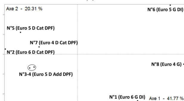
Figure 2. PCA performed for all the driving cycles and all the vehicles, with (a) the projection of emission factors and (b) the projection of vehicles.

This work was supported by FEVER (1366C0051) and CaPVeREA (1466C0001) projects funded by the French Environment and Energy Management Agency (ADEME).