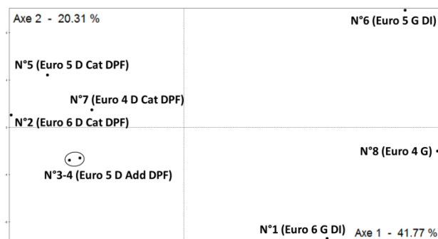
Figure 2. PCA performed for all the driving cycles and all the vehicles, with (a) the projection of emission factors and (b) the projection of vehicles.

This work was supported by FEVER (1366C0051) and CaPVeREA (1466C0001) projects funded by the French Environment and Energy Management Agency (ADEME).