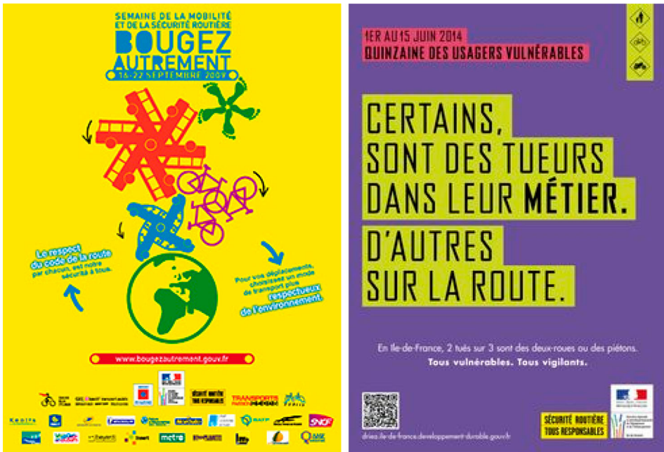
Fig. 5. Safety injunction to 'Move without Killing'.

issue tickets for running red lights or driving in bus lanes, automatic radars to control speeds, parking metres that report non-payment for parking and more cameras for organizing restricted access to certain urban areas (perimeters of urban toll systems, semi-pedestrian areas). Furthermore, this technological expansion of controls is increasingly often combined with automated penalties.