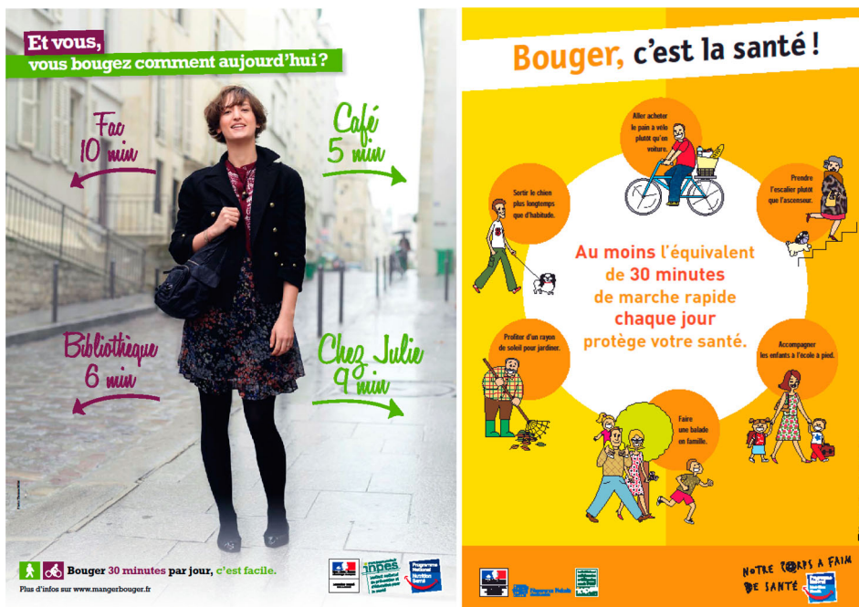
Fig. 4. Health injunction to 'Move 30 Minutes a Day'.