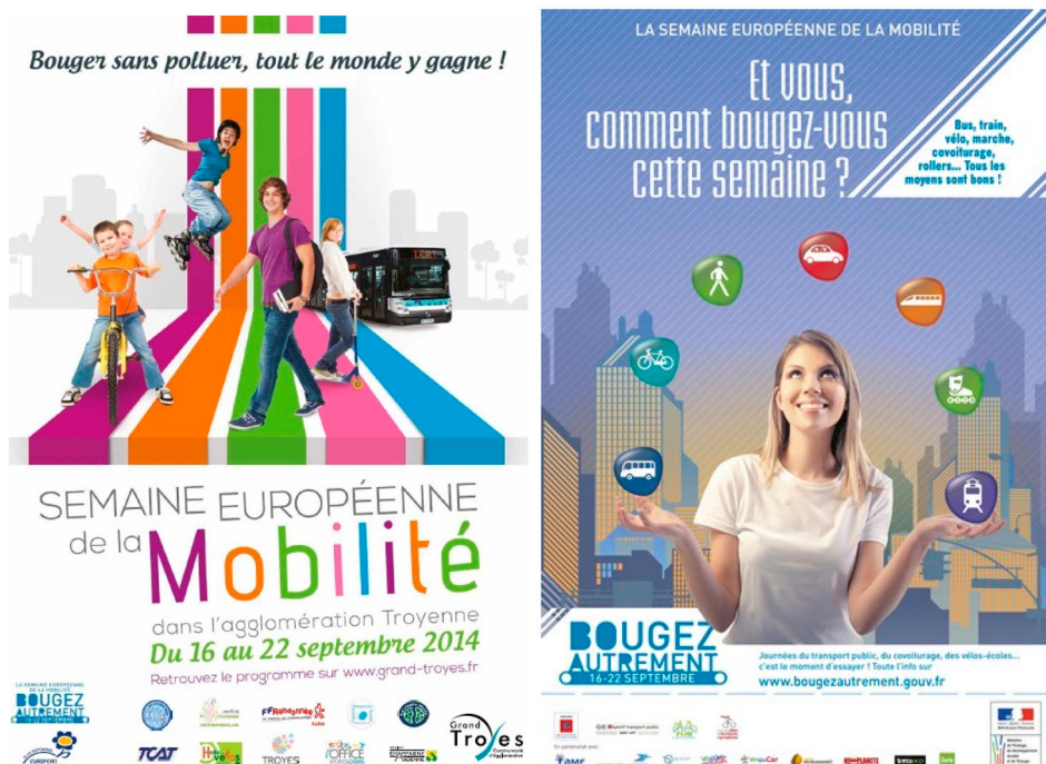
Fig. 3. Environmental injunction to 'Move without Polluting'.