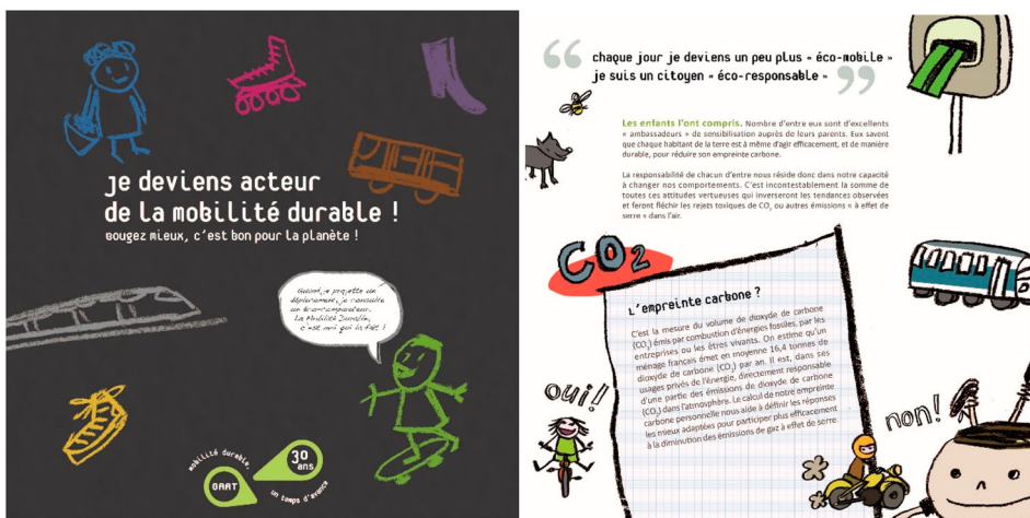
Fig. 1. The pedagogical style of communication in the management of sustainable mobility issues. Source: Groupement des Autorités Responsables des Transports, 2010, Je deviens acteur de la mobilité durable (I'm becoming a player for sustainable mobility), educational brochure, http://www.gart.org , p. 1, 3.

We are therefore indeed dealing with forms of management far from individual practices (FOUCAULT, 1994). Pedagogical communication plays a role in training citizen–customer–consumers ready to accept a degree of governance and authority. The educational imperative permeates the communication strategies used to convince