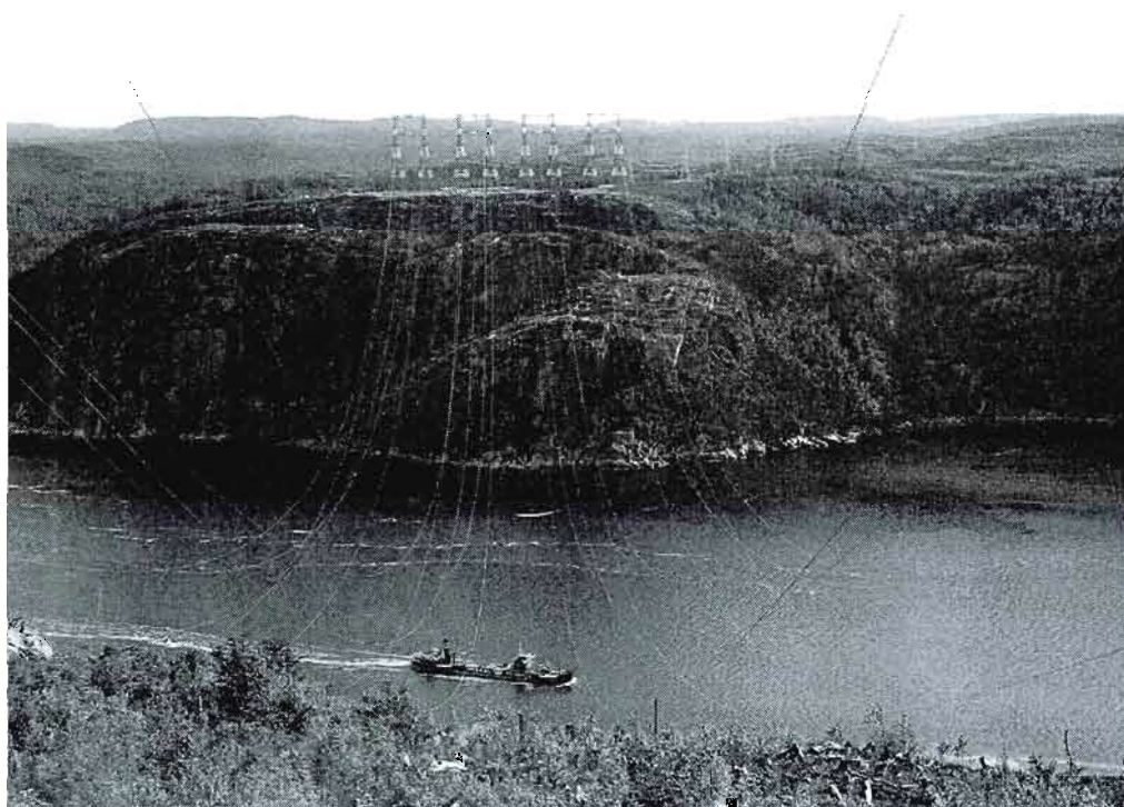
Photography n°1: The cross of the Saguenay river