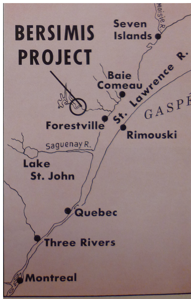
Map n°1: Bersimis localization