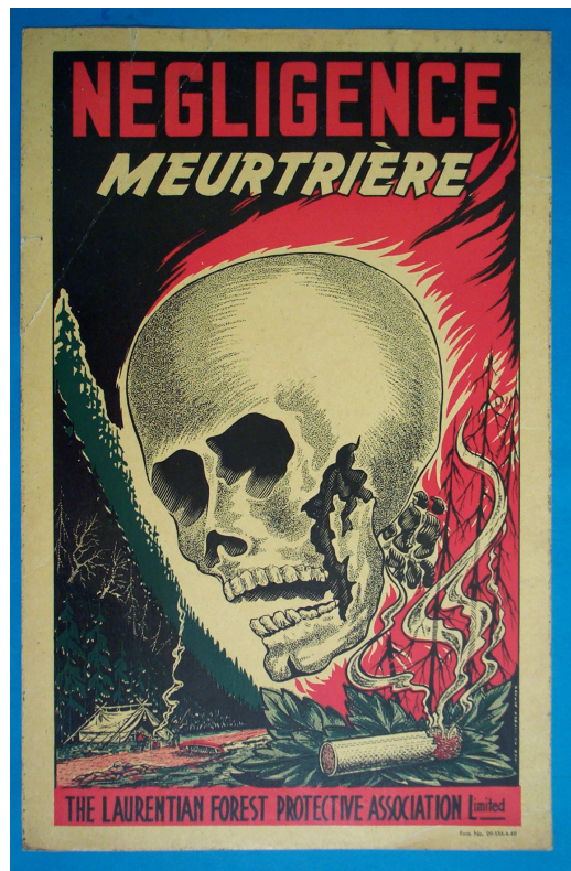
The title says "Deadly negligence"

Poster campaign n°1: Consciousness rising about ashes and cigarette butt by the Laurentian Protective Forest Association