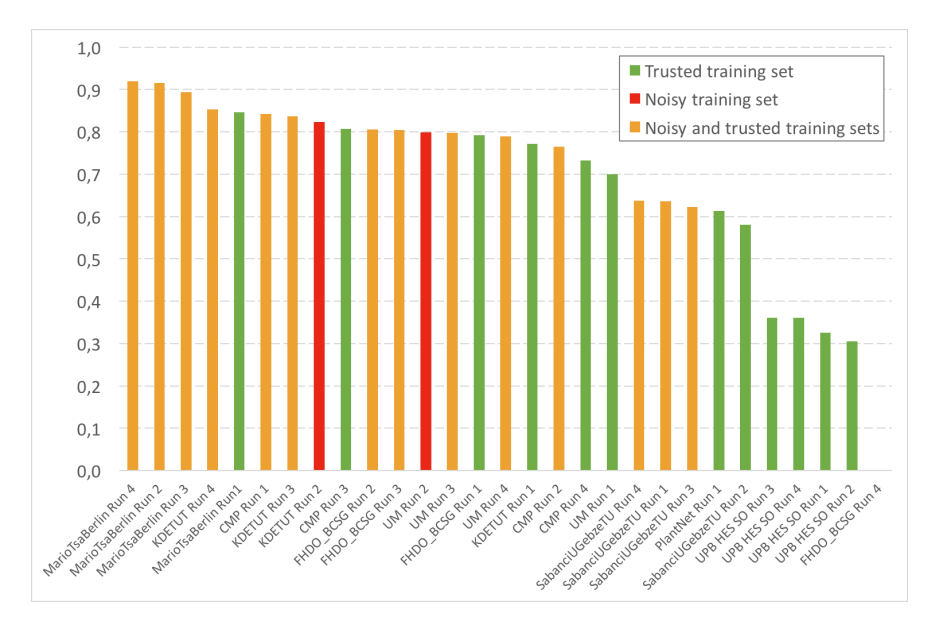
Fig. 1. Scores achieved by all systems evaluated within the plant identification task of LifeCLEF 2017 \,