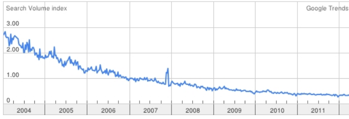
Fig. 1 Search pattern containing both terms car and automobile. User queries have included both terms at the same time frequently so that there is evidence that the both terms represent the same object