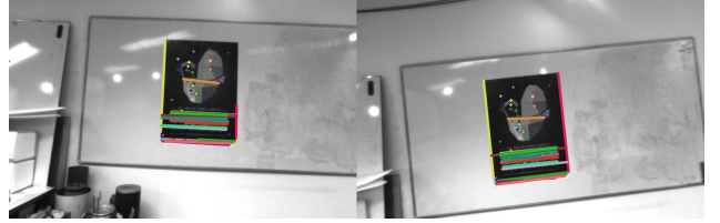
Fig. 2. Successful line matching between the image frame 169 (right) and the reference frame (left). Colorful points in both images are point correspondences used for our line matching algorithm.

Matching two sets of lines of the reference image and the current image is more involved and has been scarcely developed in literature (and in OpenCV) compared to the point matching problem. However, keeping in mind that for most of the time we have “good” matched point-features, the following simple line matching algorithm has been developed. Assume that two sets of good matched points (in homogeneous coordinates) \mathcal{S}_p := \{P_i, \dots, P_n\} from the current image and \hat{\mathcal{S}}_p := \{\hat{P}_1, \dots, \hat{P}_n\} from the reference image are available for matching two sets of lines \mathcal{S}_l := \{l_1, \dots, l_{m_1}\} and \hat{\mathcal{S}}_l := \{\hat{l}_1, \dots, \hat{l}_{m_2}\} from the same respective images. For any point and any line on the planar target, it is verified that P_i = G^{-1}\hat{P}_i and l_j = \lambda_j G^T \hat{l}_j , with \lambda_j := \frac{1}{|G^T \hat{l}_j|} . Therefore, for any two points (of index i_1 and i_2 ) and a line (of index j ), one has