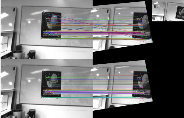
Fig. 1. Matching point correspondences between the warped image frame 264 (warped by the predicted homography) and the reference frame. Poor matching (top) and excellent matching (bottom) before and after applying our outlier removal procedure. Reference frame (left), warped current frame (right), current frame (small image on top right corner).

with S, D pre-defined positive thresholds ( S = 30, D = 80 in our experiments). Again, we have purposefully avoided the use of more sophisticated (and much more computationally expensive) alternative algorithms for outlier removal, such as RANSAC [4]. Our simple and fast outlier removal method has yielded quite remarkable matching results as for the test sequence there are either none or very few outliers (see Fig. 1 and the supplemental video).