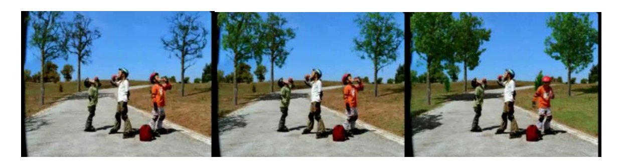
Figures 6, 7 and 8. Children and nature regaining energy as they drink Danonino (German commercial, 2003)

One story indirectly takes the underlying anxiety which is very present in German society for not performing well in school, and presents a happy scenario of a boy who runs home showing his mother his top grade. Thus by showing this happy situation, the opposite is indirectly sketched as the negative and worrying situation (not achieving a good grade). 'Playful' learning is portrayed as a theme in several ads across the sample as the opposite of 'painful' learning, which is a source of anxiety to parents.