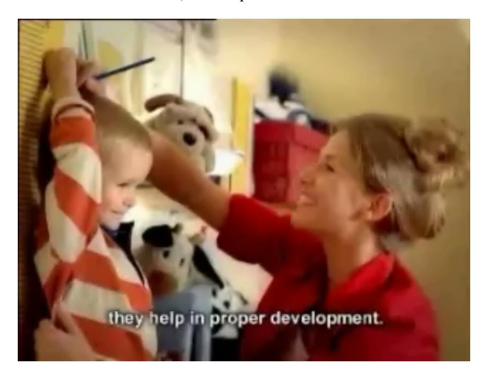
Figure 1. Example from a Polish Danonino commercial (2002)

This text clearly uses the tensive rhetoric indicating invisible risks (lack of calcium, children's lives that can be ruined from the start) and the product as the solution.