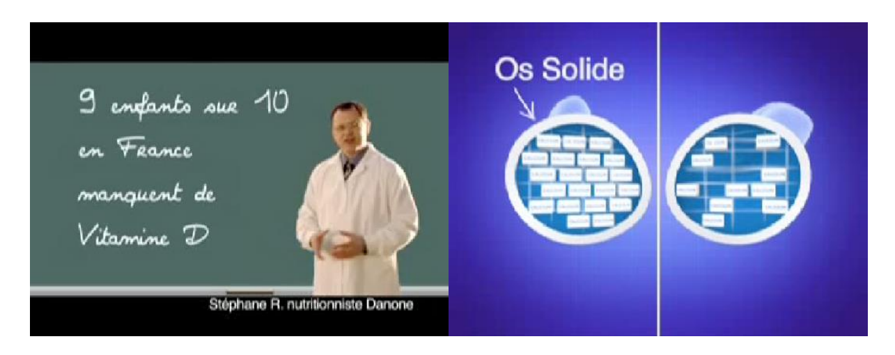
Figures 2 and 3. 9 out of 10 children in France lack vitamin D / strong bones (French commercial, 2006).

In the German commercials, a very strong emphasis is placed on "without crystal sugar" and the fact that "no additives" are included. This shows that Danone is aware that German consumers are extremely wary of industrial foods and very concerned about organic production methods<sup>57</sup>. Furthermore, in the German sample, the Danonino product is frequently shown in proximity to fresh fruit. This focus is not very strong in the French and Spanish commercials and is totally missing in the Polish and Russian commercials, as these appear to be markets with a less accentuated suspicion on industrialised food production.