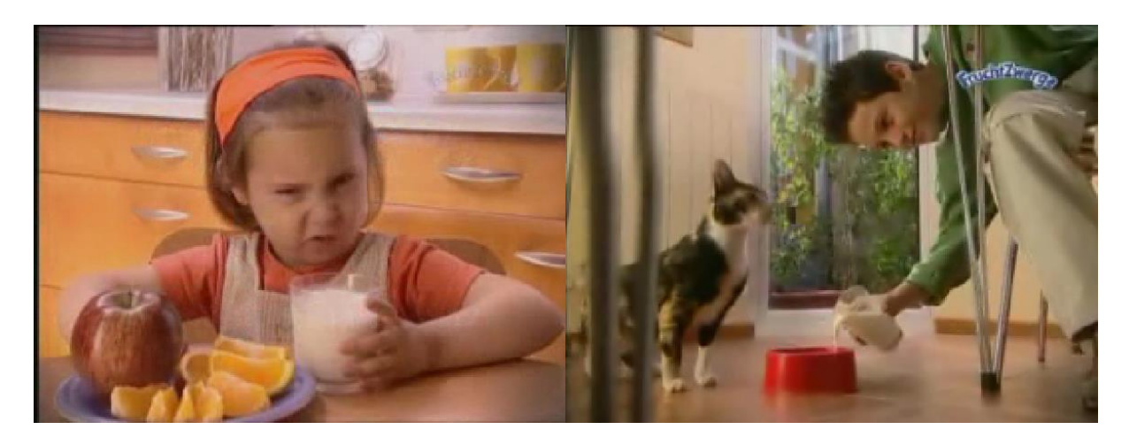
Figures 4 and 5. Children refusing fruit and milk – examples from German Danonino commercial (2003)

In the French and Polish commercials, medical doctors and dentists along with research institutes appear in the commercials. They are dressed in white coats symbolising expertise and authority, signifying expert knowledge about health and scientific certitude about what to do to lower anxiety about preserving and building the child's health. They offer one coherent explanation about what to do, e.g. one Danonino yoghurt a day, which is contrary to the perceived uncertainties and the general lack of institutional control within Western societies described in the theoretical section. The health experts are brought in to relieve anxiety – after having fuelled this same anxiety by demonstrating what might go very wrong - by reassuring the worried mother and create trust and confidence in the Danonino brand. Teachers and child-minders in Kindergartens are also used as experts, especially in the French, Spanish and Polish commercials.