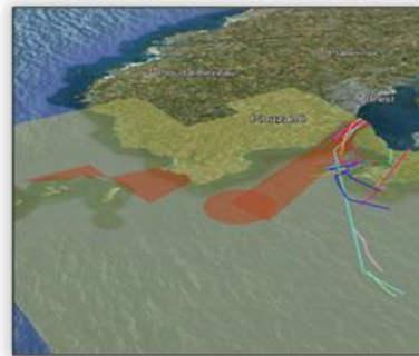
Fig. 3. Calling a spatial operation using Java Topology Suite

rule "Rule 7" salience 20 when $resare : Resare() $trajectory : AisTrajectory() eval($trajectory.getGeom(). intersects($resare.getWkb_geometry())) then logger.logMessage(""); end