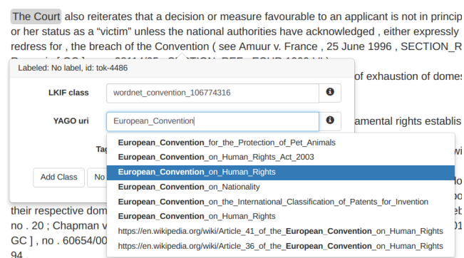
Fig. 2. The annotation of the entity Convention in LOAV.