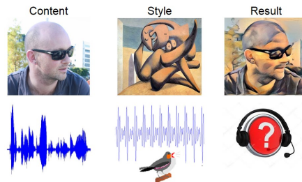
Fig. 1. Audio style transfer: Drawing analogy from example-based image stylisation.

Both visual texture synthesis, whose goal is to synthesize a natural looking texture image from a given sample, and visual texture transfer, which aims at weaving the reference texture within a target photo, have been long studied in computer vision [1, 2]. Recently, within the era of convolutional neural networks (CNNs), these subjects have been revisited with great success. In their seminal work, Gatys et al. [3] exploit the deep features provided by a pre-trained object recognition CNN to transfer by optimization the “style” (mainly texture at various scales and color palette) of a painting to a photograph whose layout and structure are preserved. The result is a pleasing painterly depiction of the original scene. This is a form of example-based non-photorealistic rendering, which is now available in many social applications. Since then, the