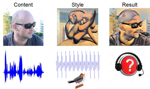
Fig. 1. Audio style transfer: Drawing analogy from example-based image stylisation.

Both visual texture synthesis, whose goal is to synthesize a natural looking texture image from a given sample, and visual texture transfer, which aims at weaving the reference texture within a target photo, have been long studied in computer vision [1, 2]. Recently, within the era of convolutional neural networks (CNNs), these subjects have been revisited with great success. In their seminal work, Gatys et al. [3] exploit the deep features provided by a pre-trained object recognition CNN to transfer by optimization the “style” (mainly texture at various scales and color palette) of a painting to a photograph whose layout and structure are preserved. The result is a pleasing painterly depiction of the original scene. This is a form of example-based non-photorealistic rendering, which is now available in many social applications. Since then, the