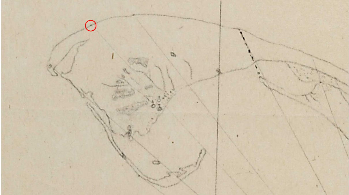
Figure 4: detail of the map on tracing paper (see fig. 2). The red circle is an example of a point of intersection between Thoreau’s radiating straight lines and the coastline of the Cape. Thoreau marked each intersection with his pencil.

In other words, the map with the radiating lines is far from being “Thoreau’s most sophisticated piece of cartography.” On the contrary, it is merely a draft and an intermediary stage in the process of producing the third map, which is drawn on thicker paper and contains more details, such as place names and boundary lines. Another detail proves that these two maps are closely related. On the map on tracing paper, Thoreau has drawn a mark with his pencil at the point of intersection of each radiating line with the coastline of the Cape (see fig. 4). A close examination of the reduced map on thick paper shows that the exact same points have also been marked on that copy (see fig. 5). These are the points of reference used by Thoreau in the process of reducing the large map.