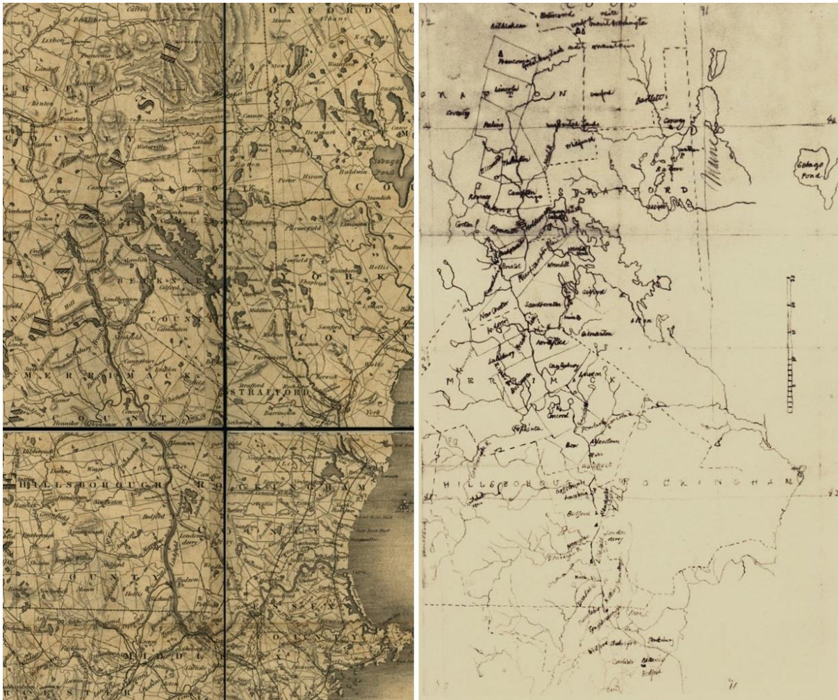
Figure 1: comparison of a portion of Nathan Hale's Map of the New England States (1826) with Thoreau's tracing 6 .

Thoreau might have copied the map before the excursion, with the purpose of creating a document that he could easily carry with him and refer to to locate the invisible boundary lines separating the villages. As the two brothers were paddling their way upstream, they had no other way to know which township they were crossing. And, according to Thoreau's account in A Week , knowing exactly where they were seems to have been a major concern for the two brothers. As a narrative, A Week seems to always know exactly where it is going. The carefully organized timeline of the successive chapters (from "Saturday" to "Friday") reflects the way the account itself is spatially "anchored." With unfailing regularity, the narrator informs the reader of the position of the boat and of the names of the villages they are crossing. In "Tuesday," for example, Thoreau writes: "Our course this morning lay between the territories of Merrimack, on the west, and Litchfield, [...] on the east" (194). The phrase "the territories of" suggests that Thoreau is not referring here to the center of the village as a visual landmark, but rather to the administrative division of the area into townships – an invisible network of geometric shapes that is only perceptible on the map he has copied.