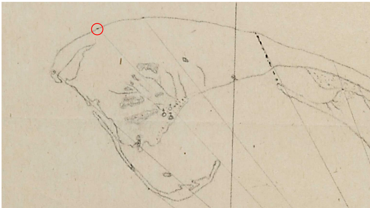
Figure 4: detail of the map on tracing paper (see fig. 2). The red circle is an example of a point of intersection between Thoreau’s radiating straight lines and the coastline of the Cape. Thoreau marked each intersection with his pencil.

In other words, the map with the radiating lines is far from being “Thoreau’s most sophisticated piece of cartography.” On the contrary, it is merely a draft and an intermediary stage in the process of producing the third map, which is drawn on thicker paper and contains more details, such as place names and boundary lines. Another detail proves that these two maps are closely related. On the map on tracing paper, Thoreau has drawn a mark with his pencil at the point of intersection of each radiating line with the coastline of the Cape (see fig. 4). A close examination of the reduced map on thick paper shows that the exact same points have also been marked on that copy (see fig. 5). These are the points of reference used by Thoreau in the process of reducing the large map.