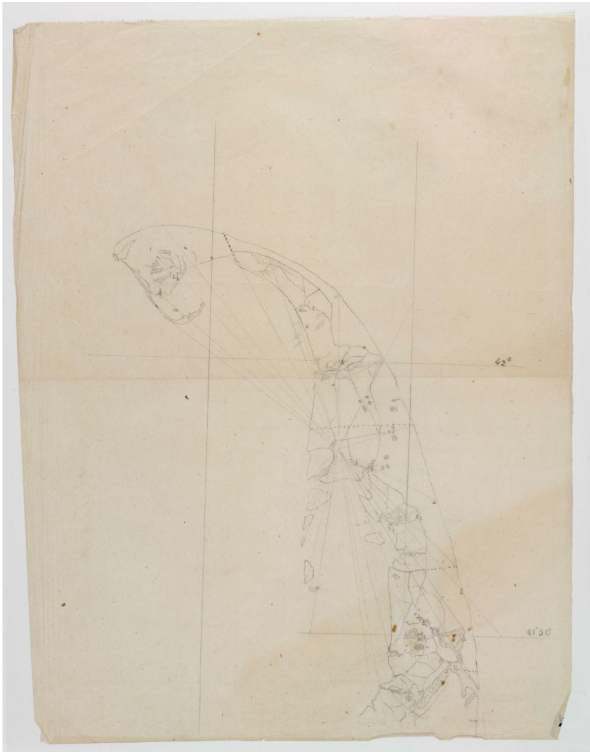
Figure 2: Thoreau's tracing of a map of the northern extremity of Cape Cod. The map is drawn on thin tracing paper 12 .

What Stowell failed to notice is that the map on tracing paper is actually a copy of the larger map that represents the entire peninsula: like the map in the Concord Library, it is a tracing of Borden's map of Massachusetts. As for the radiating lines, they were not used to maintain proportions on this drawing, but only to produce the third map, which is noticeably smaller (see fig. 3). The straight lines drawn by Thoreau enabled him to reduce the dimensions of his first map, possibly by using the principle of similar triangles: with this method, the topographical features inside each triangle can be reduced while maintaining the same dimensional relationships between the different