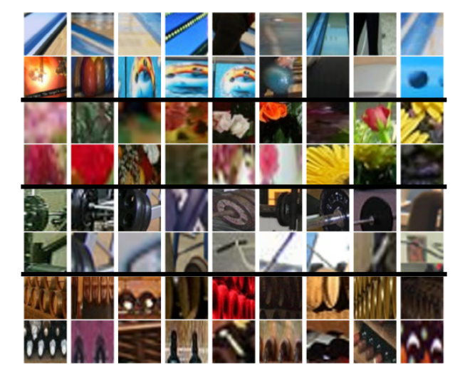
Figure 2. Top scoring parts for various images of bowling, florists, gym and wine cellar.

behind this choice is that, because the simplex \mathcal{S}_{\kappa} is larger as \kappa increases, the optimal matrix is more likely to lie inside the simplex, with values between 0 and 1 (soft assignment). This effect can be compensated by using a negative value for \rho , which yields a hard assignment solution in practice in our experiments.