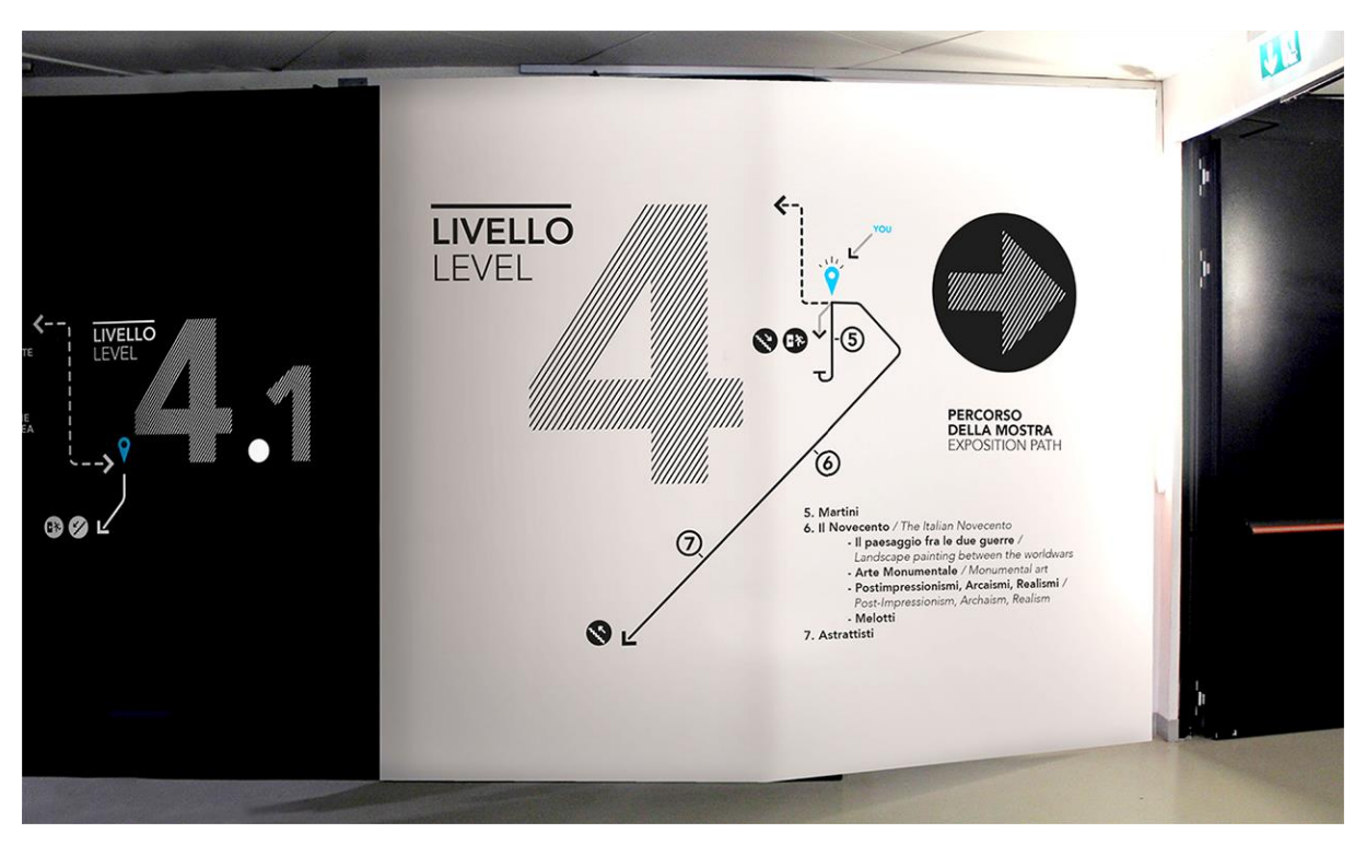
Figure 3. Photomontage for the layout of one of the various solutions suggested by the students. Students: Federica Califano, Emilio La Mura, Alice Paganini, Giovanna Spiezia, Marco Tasca.

moment: for example, from intentionality (of the designer) to the effect (on the user), from the product to the cohesiveness of its contents or to its schemes of use. The so-called beauty , in design, must be actually interpreted as expressive clarity of the artifact, as pleasantness that favors the reaction and as satisfaction for the received service. In other word, the aesthetic dimension is part of the projecting language of design.