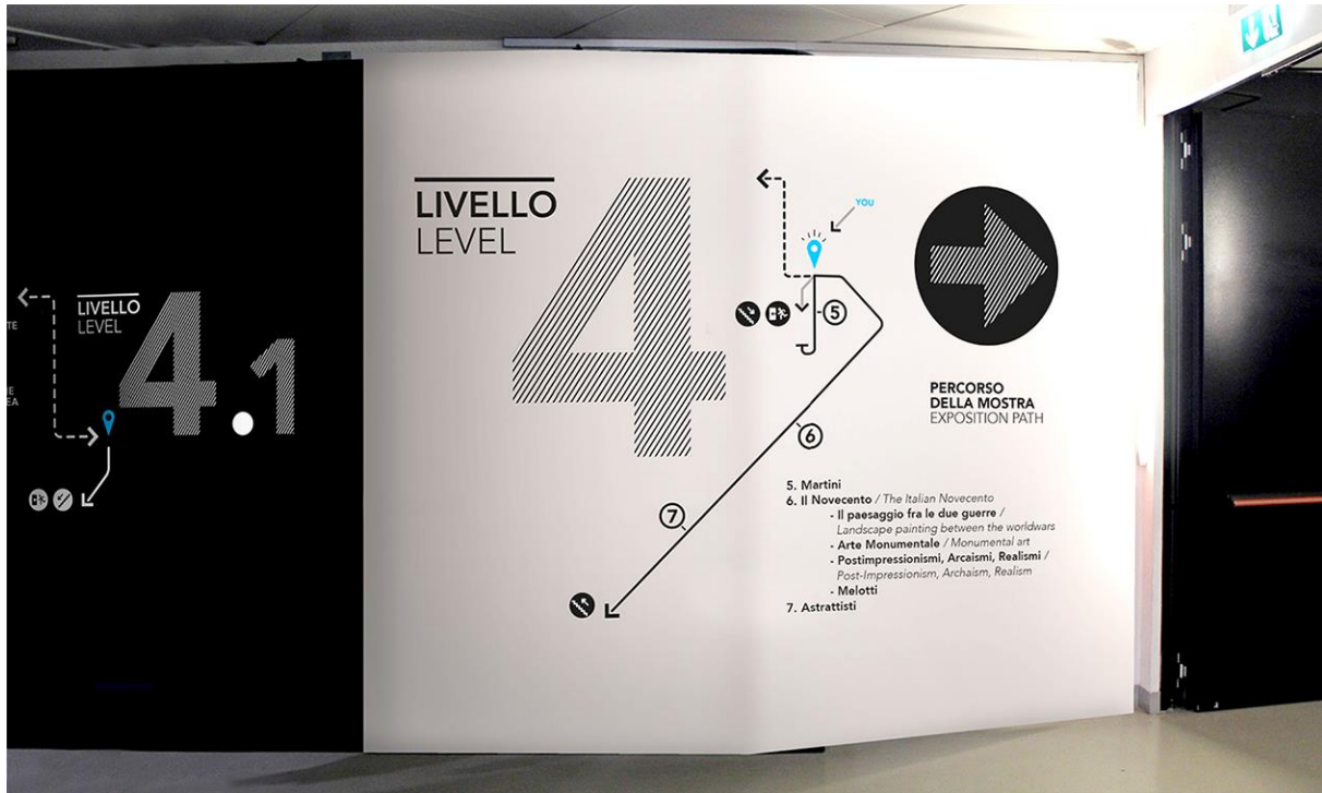
Figure 3. Photomontage for the layout of one of the various solutions suggested by the students. Students: Federica Califano, Emilio La Mura, Alice Paganini, Giovanna Spiezia, Marco Tasca.

moment: for example, from intentionality (of the designer) to the effect (on the user), from the product to the cohesiveness of its contents or to its schemes of use. The so-called beauty , in design, must be actually interpreted as expressive clarity of the artifact, as pleasantness that favors the reaction and as satisfaction for the received service. In other word, the aesthetic dimension is part of the projecting language of design.