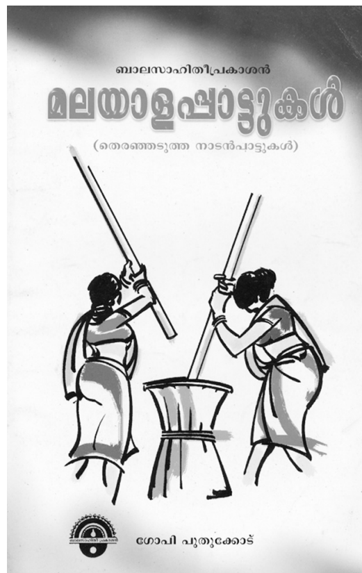
Plate 1.3: Front cover of the book Malayalam Songs: Selection of Folk Songs (Malayalappattukal. Terannatutta natanpattukal) by Gopi Putukode. All rights reserved. Courtesy of Christine Guillebaud.

These expectations are far from what happens in reality. Is there any real connection between a game of ‘Simon Says’ and the fact that one will adopt a vegetarian diet, or settle a Hindu deity at home? As a matter of fact, children take part in the activities offered to them, but it is still difficult to evaluate their role in the cultural mediation of Hindu values in the family circle. More broadly speaking, the organisation’s educative programmes are based on a rather caricatural conception of what should be the learning process as well as a fundamentally anti-sociological conception of culture.