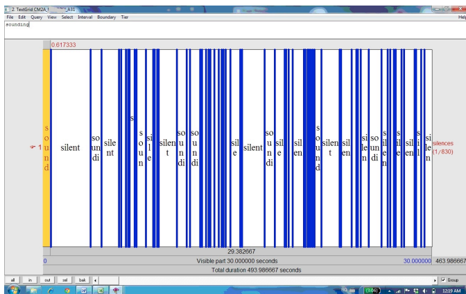
Fig. 3. Example of extracting silence/sound using Praat [10]

The data extraction operation allows us to view the starting moment of the reading/verbalization, and the closing moment, viewing the total length of reading and verbalization, as well as the moments of silence and sound.