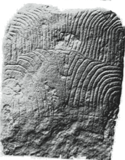
Figure 3. Virtual lights on C5 orthostat.

In addition to the classical data processing (generation of a high definition mesh size from the point cloud; treatment of this mesh size to extract engravings in plan; highlighted of the morphology of the orthostate) we examined the metrology of engravings in order to study the differential alteration of the figures. Our hypothesis stipulates, indeed, that several orthostates in the passage and chamber are reused stele which, previously to the construction of the tomb, were exposed in the open air. Stone surfaces exposed to the particularly dense weathering of sea cost contexts show different alteration according to their exposition to the atmospheric agents.