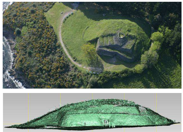
Figure 1. Gavrinis passage tomb under the cairn restored in façade (aerial photo CG56)

3 km away from Gavrinis. A perfect correspondence between the truncated engraving of an animal (caprine) known from the XIXth century, and its graphic continuation recorded in Gavrinis' roofstone made it possible to join these two broken fragments of an ancient single stele.