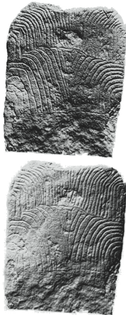
Figure 3. Virtual lights on C5 orthostat.

In addition to the classical data processing (generation of a high definition mesh size from the point cloud; treatment of this mesh size to extract engravings in plan; highlighted of the morphology of the orthostate) we examined the metrology of engravings in order to study the differential alteration of the figures. Our hypothesis stipulates, indeed, that several orthostates in the passage and chamber are reused stele which, previously to the construction of the tomb, were exposed in the open air. Stone surfaces exposed to the particularly dense weathering of sea coast contexts show different alteration according to their exposition to the atmospheric agents.