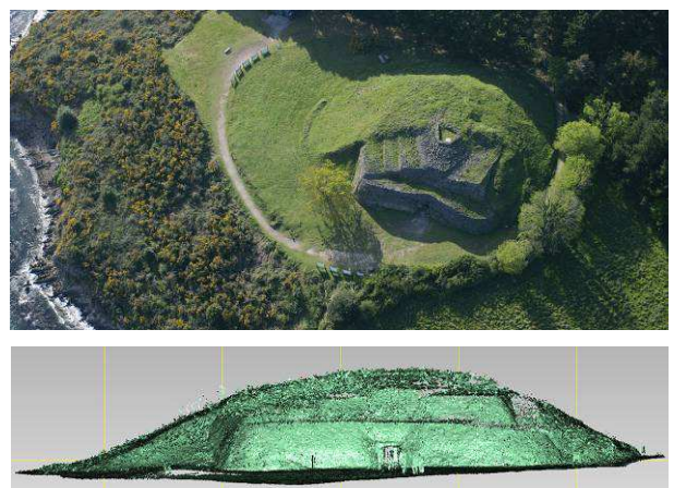
Figure 1. Gavrinis passage tomb under the cairn restored in façade (aerial photo CG56)

3 km away from Gavrinis. A perfect correspondence between the truncated engraving of an animal (caprine) known from the XIXth century, and its graphic continuation recorded in Gavrinis' roofstone made it possible to join these two broken fragments of an ancient single stele.