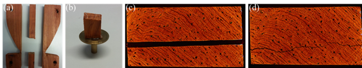
Figure 3: Image acquisition protocol by: (a) - scanned specimen; (b) - 3D cross-section of Padouk under wet conditions: specimen with a 22 mm pre-cut; (c) - crack path (d).

The tested specimen is cut according to the direction of cracking initiated by a pre-cut of 22 mm (b). The wood sample to be scanned is then introduced into the microtomograph chamber (b). After reconstruction, a 3D volume is obtained from several 2D scans at 4 \mu\text{m} resolution (Figs. 3 (c) and (d)). Images on healthy and cracked samples were taken under dry and wet conditions, respectively. Fig. 3 (d) shows the ability of the MXT to detect and track internal crack growth in tropical timber.