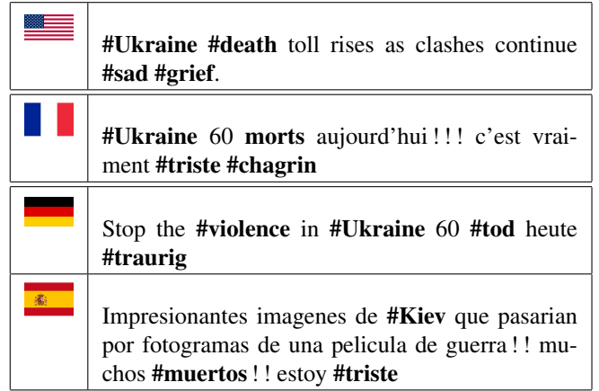
TABLE 2 – Example of comparable tweets

For each label of the Table 1 and for each language, we wish to extract the associated lexicon. Table 2 illustrate an example of comparable tweets in four languages ; the four tweeter talked about the same topic violence in ukraine expressing the same emotion Sadness in different languages. So, based on such data our approach aims to extract, across different languages, and for each affective label the