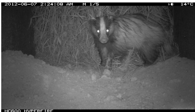
FIGURE 2 Camera trap and video camera field of view

outside underpasses and attached to the wall 15–40 cm from the ground inside WUs.