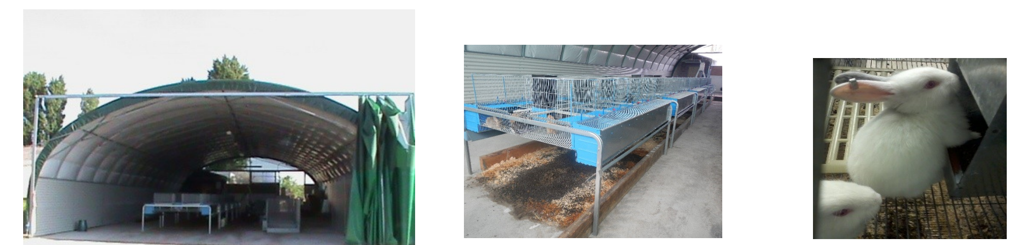
Breeding unit : INRA, Carmaux