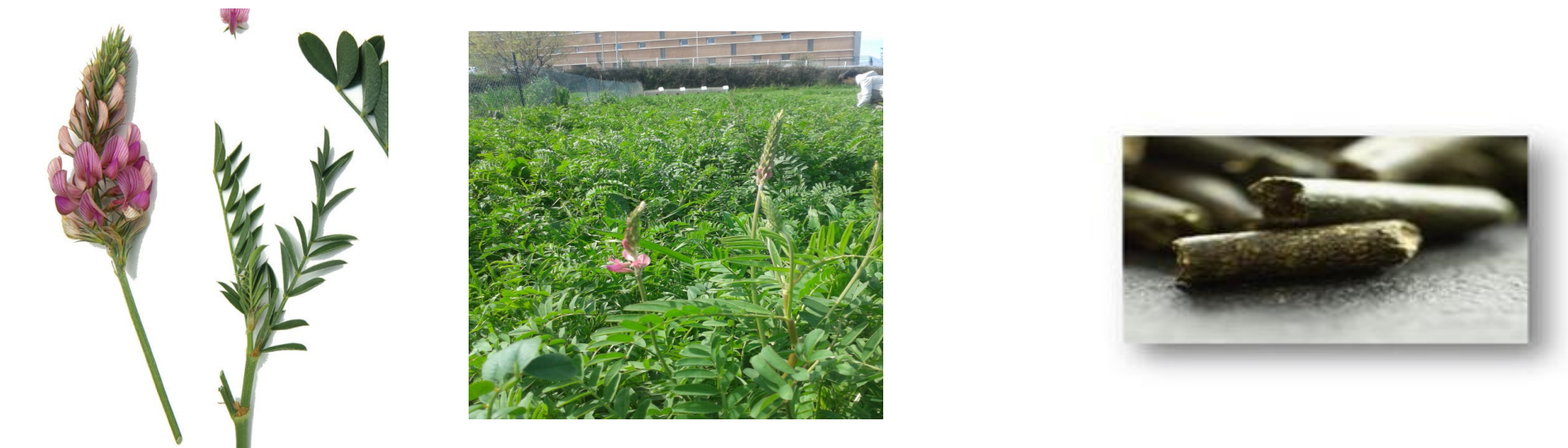
Sainfoin: plant, field, and dehydrated pellets

Feeds characteristics Sainfoin big pellets : 6mm diameter, 15-23mm length, hardness=93 Mpa, crude protein=17.2%, NDF =37.2 % ADF =30.4%, ADL=12.0%.