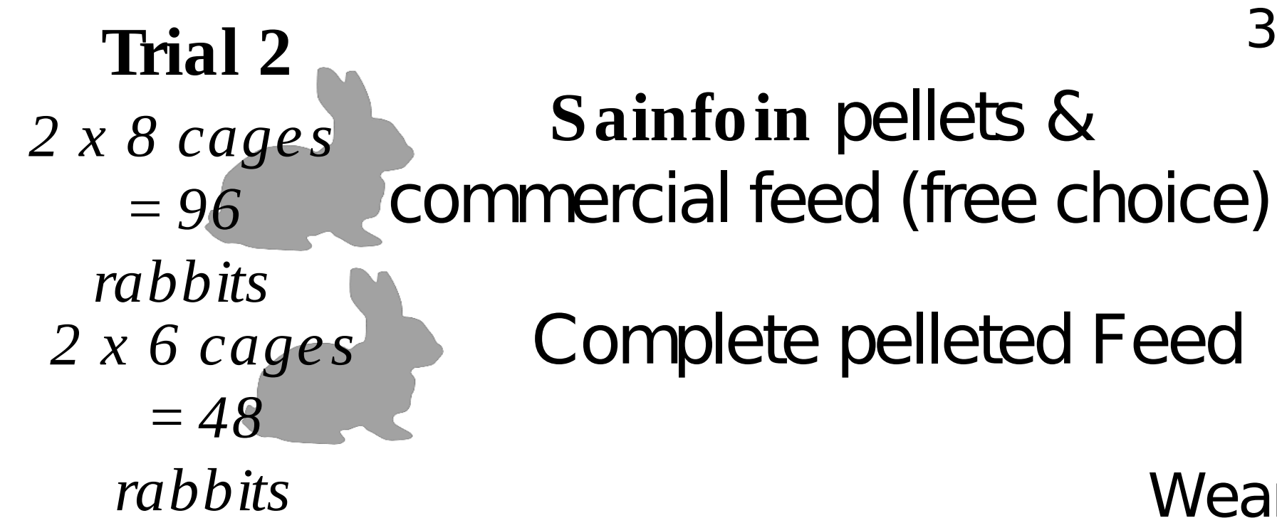
Waning Live weight + intake controls

Complete pelleted feed : 4mm diam., 9-12mm length, hardness= 6.5 Mpa, crude protein=15.9%, ADF =18.0, ADL=5.5%)