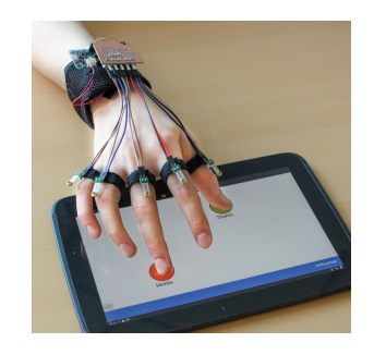
Figure 3: Our wireless device prototype. The micro-controller and battery are attached to the wrist. The sensors are moved to the third phalanx near the palm.

We designed our hardware and software to make them easy to replicate. We therefore intentionally used a simple signal processing algorithm. The simple algorithm can be used as the backbone on which heuristics tailored to a particular problem can be added. Further improvements would depend on the interaction context, and would need to be tailored to each application. For example on a touchpad when inputting a chord using the index and middle finger with the right hand, the left contact is expected to be an index finger. On a keyboard one can expect the numerical keypad cannot be used with the left hand. Since the interaction context matters, we wanted to assess first the "raw" accuracy of the device with simple heuristics tailored for our contexts. In addition, after testing the device, we believe future work should focus on improving the signal quality and accuracy (precise latency estimation and high frequency signal) rather than delegating the signal processing to a machine learning algorithm.