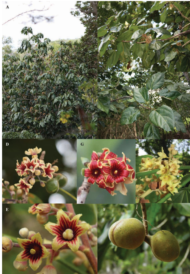
FIGURE 2. — Acropogon mesophilus Munzinger & Gâteblé spec. nov. (A–F), A. bullatus (G) & A. veillonii (H): A. Overview of a single big tree. B. Flowering branch. C. Leaves. D. Inflorescence. E. Male (left) and female (right) flowers. F. Follicles. G–H. Inflorescences. Gâteblé 711 (A–B), Gâteblé et al. 685 (C), Gâteblé 719 (D), Le Borgne 58 (E–F), Gâteblé & Butaud 733 (G), photos by G. Gâteblé (A–D & G), T. Le Borgne (E–F) & J.-F. Butaud (H).

Flowers ♂ and ♀ of the same size and perianth. Calyx 8–12 mm long, 7 mm in diameter, yellow [group 10C–D of RHS 2001] with 2–4 grayish-purple [group 187A–D of RHS 2001] stripes per calyx lobe, fused basally ca. 5 mm, lobes (4–)5(–6), 4–5 mm long, triangular-fimbriated. Flowers ♂: androecium (3–)4(–5) mm long; androphore 3–4 mm long; stamens 5–7, 1–1.5 mm long, inserted at apex of androphore. Flowers ♀: Staminodes 5–7, sessile, ca. 0.5 mm long inserted at base of carpels. Gynoecium sessile 4–5 mm long; carpels 3–4, 3–4 mm long; styles ca. 1 mm long, covered with dense tomentum; stigmas ovoid.