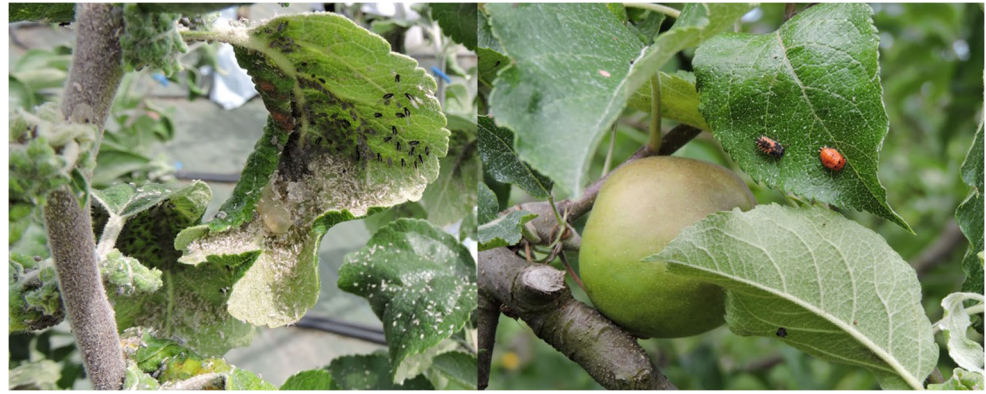
Fig. 1 Left photograph , aphid colony on apple tree. Right photograph , ladybeetle larva and pupa on apple tree