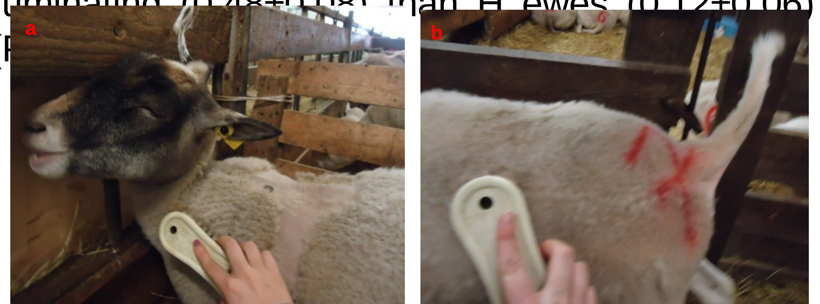
Figure 2. a. Facial expressions of a Romane ewe during brushing. Closed eyes and rumination can be observed.; b. Tail held up and wagging.

Brushed ewes also wagged their tails for longer (Fig.2B) than non-brushed sheep mainly during (B: 0.16 \pm 0.05 ; H: 0.01 \pm 0.003 ) and after the treatments ( 0.02 \pm 0.009 ; 0.007 \pm 0.002 ) ( P < 0.01 ). Among R+ sheep, B ewes spent more time ruminating ( 0.48 \pm 0.08 ) than H ewes ( 0.12 \pm 0.06 ) ( P < 0.01 ).