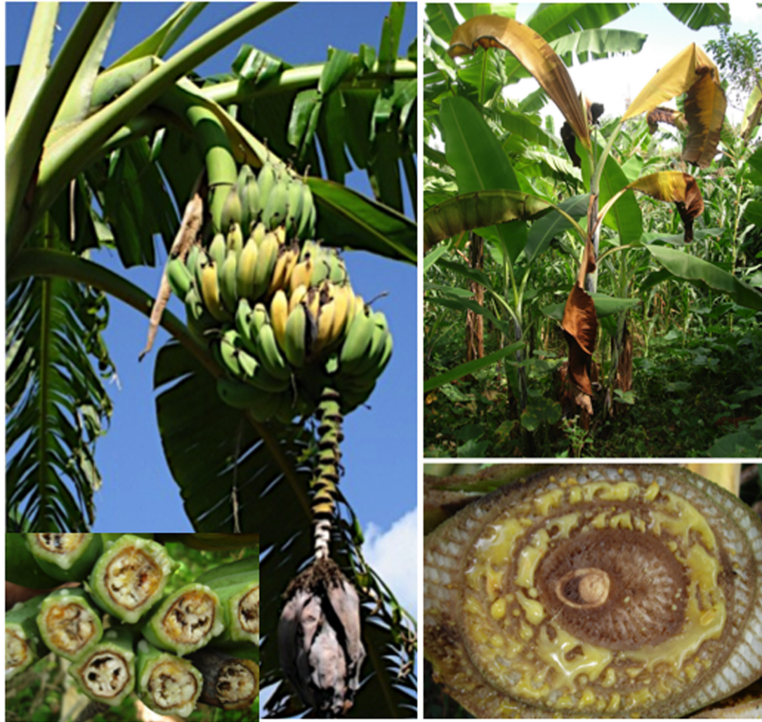
FIGURE 2 | Xanthomonas bacterial wilt of banana caused by X. campestris pv. musacearum . The photos depict leaf yellowing and wilting, exudation of bacterial ooze, premature fruit ripening and fruit discoloration.

strains of the disease were already present on solanaceous and other crops, including Musa textilis in 1969 (Zehr, 1970; Eden-Green, 1994a; Seal and Elphinstone, 1994; Taghavi et al., 1996). A first report of R. solanacearum causing Moko disease of banana in Malaysia was published by Zulperi and Sijam (2014). Reports of the occurrence of banana bacterial wilt in Cambodia and India have not been confirmed (Jones, 2000; Daniells, 2011). An outbreak of R. solanacearum on ornamental Heliconia spp. in Australia was eradicated (Jones, 2000).