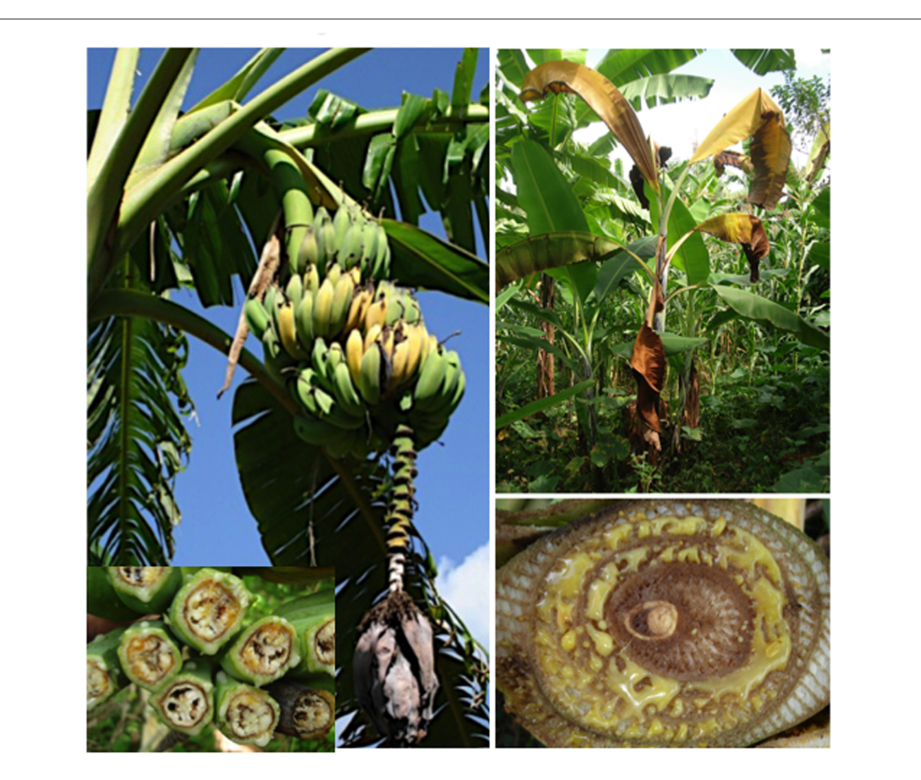
FIGURE 2 | Xanthomonas bacterial wilt of banana caused by X. campestris pv. musacearum. The photos depict leaf yellowing and wilting, exudation of bacterial ooze, premature fruit ripening and fruit discoloration.

strains of the disease were already present on solanaceous and other crops, including Musa textilis in 1969 (Zehr, 1970; Eden-Green, 1994a; Seal and Elphinstone, 1994; Taghavi et al., 1996). A first report of R. solanacearum causing Moko disease of banana in Malaysia was published by Zulperi and Sijam (2014). Reports of the occurence of banana bacterial wilt in Cambodia and India have not been confirmed (Jones, 2000; Daniells, 2011). An outbreak of R. solanacearum on ornamental Heliconia spp. in Australia was eradicated (Jones, 2000).