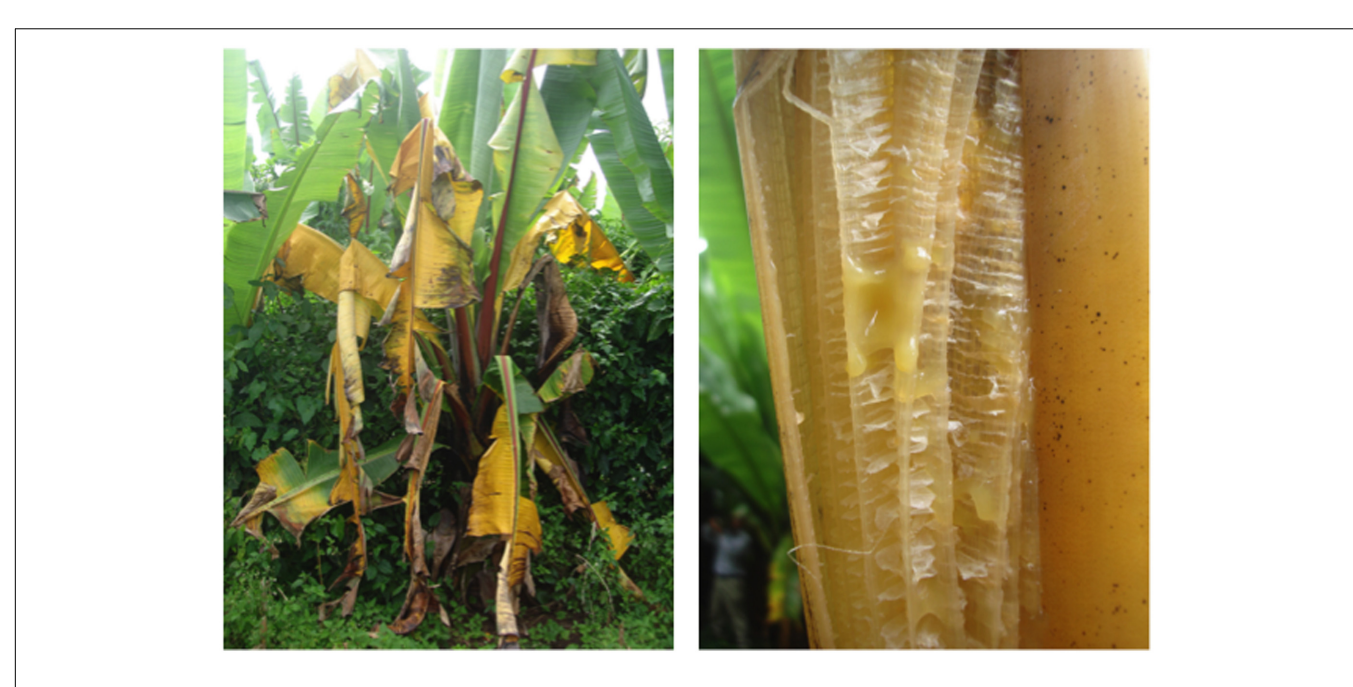
FIGURE 3 | Xanthomonas bacterial wilt of enset caused by X. campestris pv. musacearum. The photos depict leaf yellowing and wilting, and pockets of bacterial ooze in a leaf petiole. Photos were taken in Ethiopia by Guy Blomme.

by bacterial wilts reduces water flow is not completely clear. There is no evidence for excessive transpiration linked to loss of stomatal control as could possibly result from a systemic toxin (Buddenhagen and Kelman, 1964; Van Alfen, 1989). The primary factor is most likely plugging of pit membranes in the petioles and leaves by a high molecular mass extracellular polysaccharide (Van Alfen, 1989), but high bacterial cell densities, plant-produced tyloses and gums, and byproducts of plant cell wall degradation may be contributing factors (Denny, 2006).