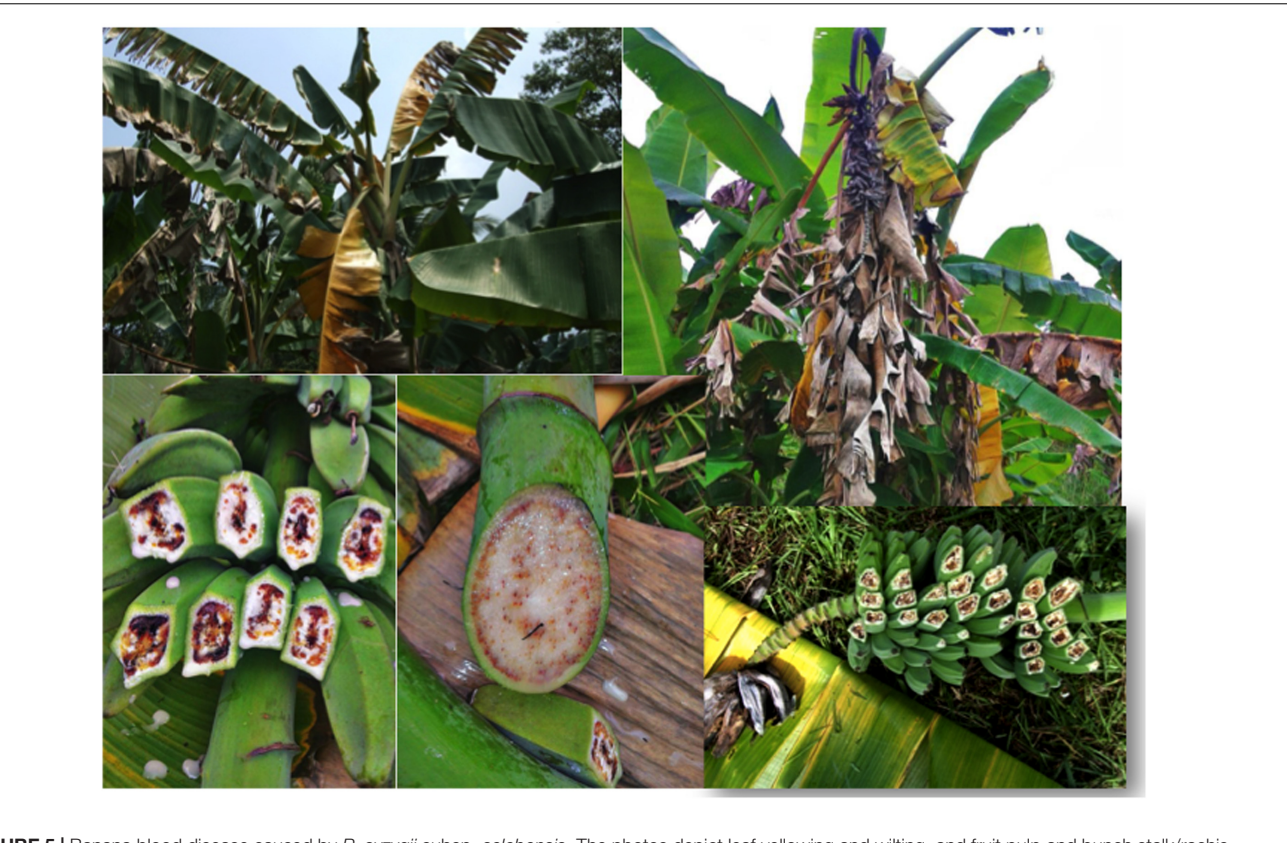
FIGURE 5 | Banana blood disease caused by R. syzygii subsp. celebensis . The photos depict leaf yellowing and wilting, and fruit pulp and bunch stalk/rachis discoloration. Photos were taken in Malaysia by Agustin Molina.

entire plant, and suckers will also wilt and die (Eden-Green and Seal, 1993; Eden-Green, 1994b; Supriadi, 2005). R. syzygii subsp. celebesensis strains causing banana blood disease is strictly related to banana (and some Heliconia ) and not to Solanaceaous hosts, unlike R. solanacearum strains causing Moko/Bugtok disease.