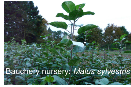
1st step: intensive selection of elite young plants in private nurseries

Previous studies have shown that as long as the sowing is not dense, the best young plants from nurseries will most generally remain the best at the end.