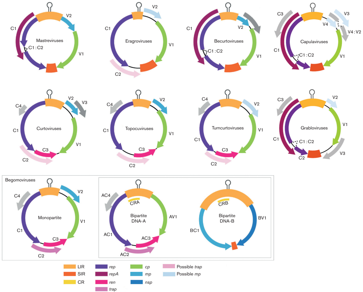
Fig. 2. Genome organization of isolates in various geminivirus lineages. The ORFs (V1, V2, V3, C1, etc.) are colour-coded according to the function of their protein products (rep, replication-associated protein; ren, replication enhancer protein; trap, transcriptional activator protein; cp, capsid protein; mp, movement protein; nsp, nuclear shuttle protein). LIR, long intergenic region; SIR, short intergenic region; CR, common region. The hairpin which includes the origin of replication is indicated in the LIR (modified from [4]).

and Turncurtovirus have monopartite genomes, whereas those in the genus Begomovirus have mono- or bipartite genomes. The genome of mastreviruses (Fig. 2) consists of a circular single-stranded DNA of 2.6–2.8 kb that encodes a capsid protein (CP, ORF V1), a movement protein (MP, ORF V2) and a replication-associated protein (Rep, expressed from ORFs C1 and C2 by transcript splicing). The genomes of bipartite begomoviruses consist of DNA-A and DNA-B components, each of 2.5–2.6 kb. The two components share approximately 200 bases of sequence within the long intergenic region (LIR) that includes the replication origin. DNA-A encodes CP (AV1/V1), a putative MP (AV2/V2; New World bipartite viruses lack AV2), Rep (AC1/C1), a transcriptional activator (TrAP, AC2/C2), a replication enhancer (REn, AC3/C3) and C4 (AC4/C4). DNA-B encodes a