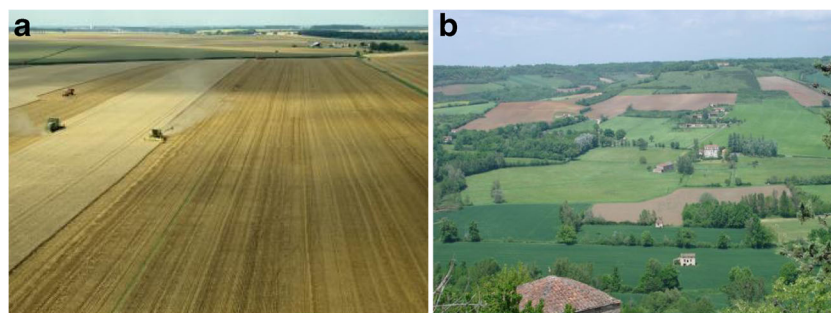
Fig. 1 Landscapes corresponding to different agriculture models (Sect. 4). a A simplified landscape shaped by input-based farming systems (Sect. 2.1) most often encompassed in globalised commodity-based food systems (Sect. 3.1). b A diversified landscape, including non-crop

habitats, in which biodiversity-based farming systems aim to develop ecosystem services from field to landscape levels (Sect. 2.3), possibly to feed alternative food systems (Sect. 3.3)