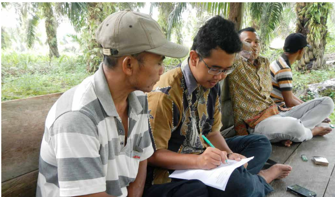
Smallholder interview in Sumatra, Indonesia, within the SPOP project

systems can be found, ranging from the family plot of 1–2 ha to agro-industrial estates with plantation blocks and extraction mills.