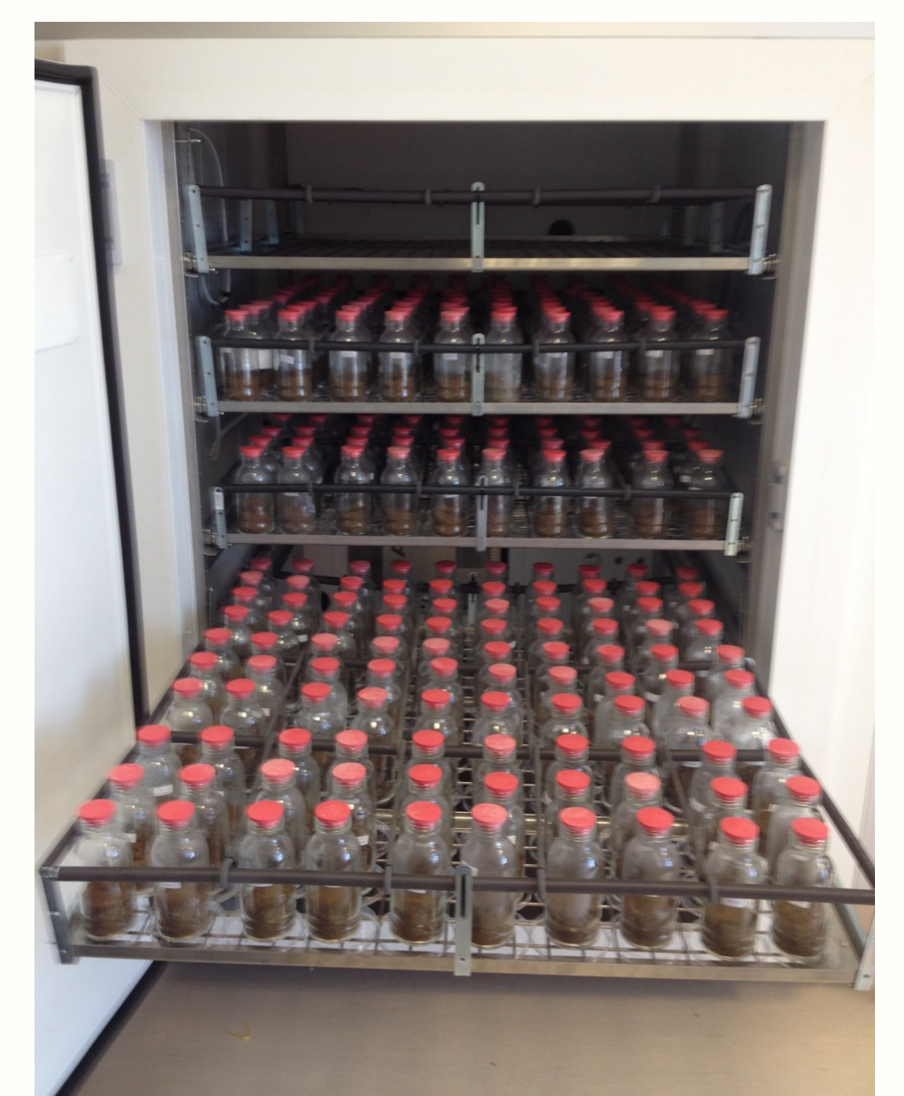
Figure 2 : Photograph of the incubation system , Montpellier Ecotron