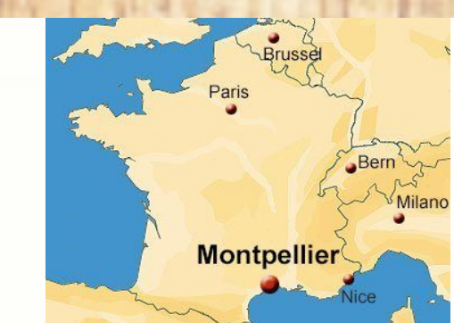
Figure 1 : Map of France