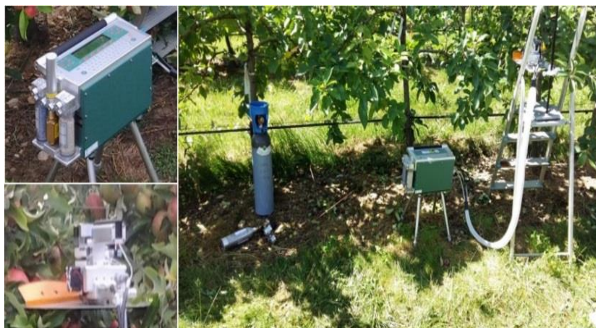
Fig. 1 Experiments used to follow C transport in the branch of apple tree: 13 CO 2 labelling with LI-6400XT portable photosynthesis system.