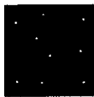
Table des illustrations

Titre Figure 1: example of a situation that is almost balanced