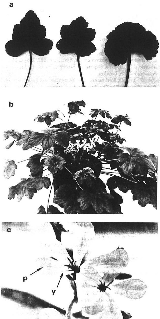
Fig. 1: a. Leaves from Pelargonium quinquelobatum (left), hybrids (middle) and P. × hortorum (right); b. hybrid P. quinquelobatum × P. × hortorum ('Happy Thought'); c. hybrid flowers pale yellow (Y) to pale pink (P)

The four bands are present in the hybrid. The Hind III pattern revealed two major bands at 1.9 and 3.2 kbp for P. quinquelobatum and two bands at 1.8 and \approx 12 kbp for P. × hortorum , whereas the hybrid contains the two maternal bands and only the largest paternal band. Currently, no data are available for the heterozygosity level of the parental genotypes. However, the Hind III restriction pattern shows that P. quinquelobatum bands were both transmitted to the hybrid, in this case the maternal plant would be homozygous for both (one locus containing a Hind III site or two loci). Only one band of P. × hortorum was transmitted to the hybrid, thus the male parent might be heterozygous at this locus. In both restriction patterns the hybrids present bands from the two parents. This result clearly indicates that the plant analysed is really a hybrid between P. quinquelobatum and P. × hortorum . The other two hybrids gave the same hybridization pattern with bands of both parents